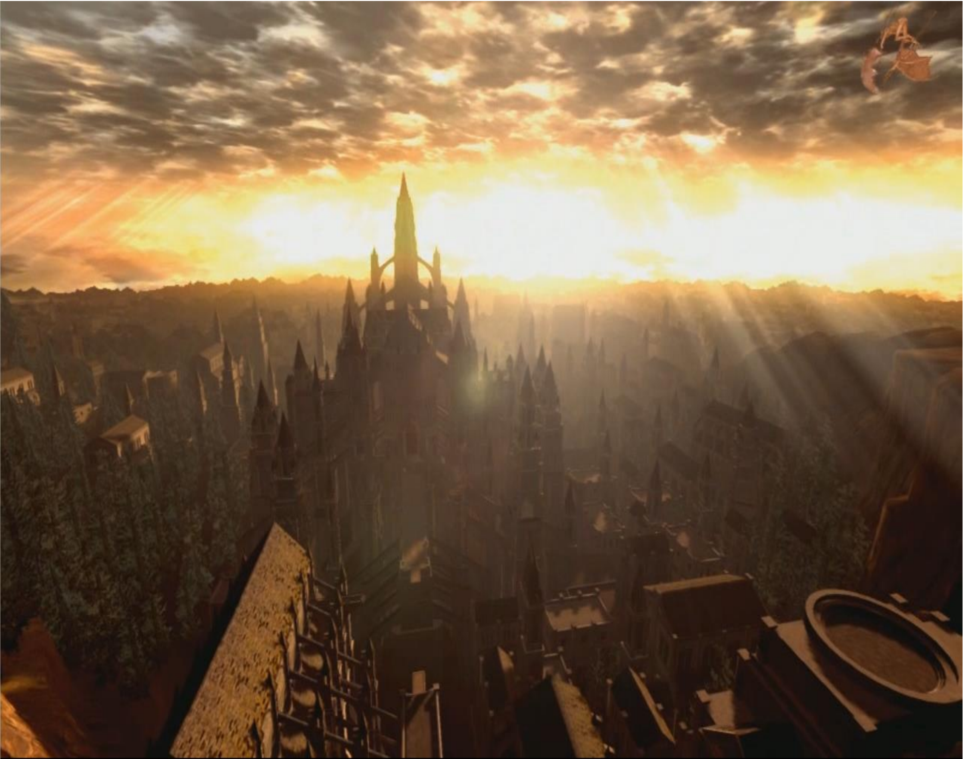
Anor Londo, the city of Gods