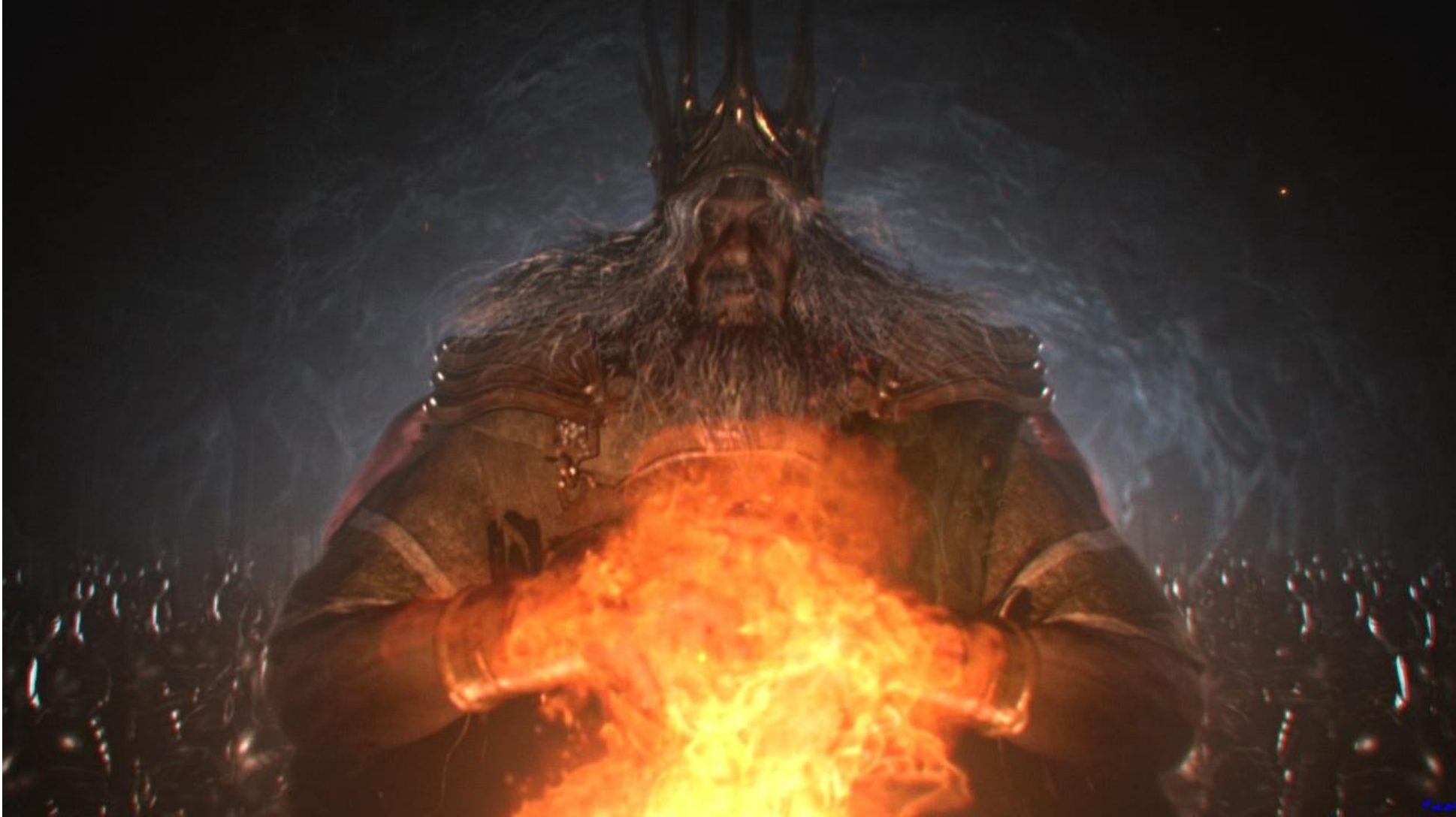
Gwyn, the Lord of Sunlight