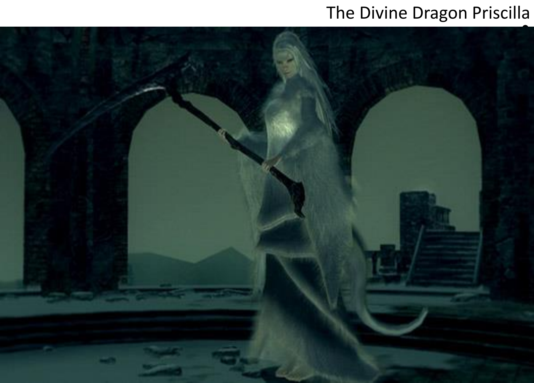
The Divine Dragon Priscilla

Dark Souls’ version has Jeremiah die, as shown by his corpse that is found behind Priscilla; Jeremiah later returns as a dark spirit to take vengeance. Jeremiah is still seen with the bloody bag partially sealed on his body.