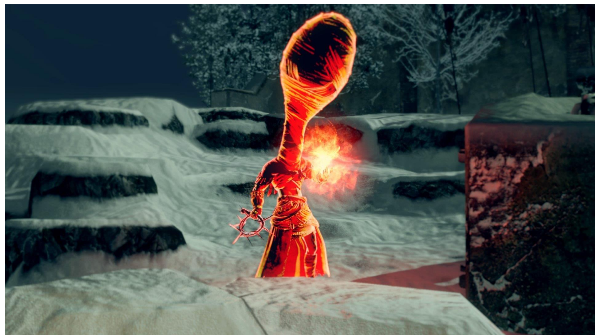
The “Cowardly” King Jeremiah as a Dark Spirit

Context to the Issue: The lore of Dark Souls is notorious for being very difficult to understand as its story is mainly told environmentally and through brief in-game item descriptions. However, further inspection of the lore, it is clear that Dark Souls is heavily inspired by medieval Welsh mythology.