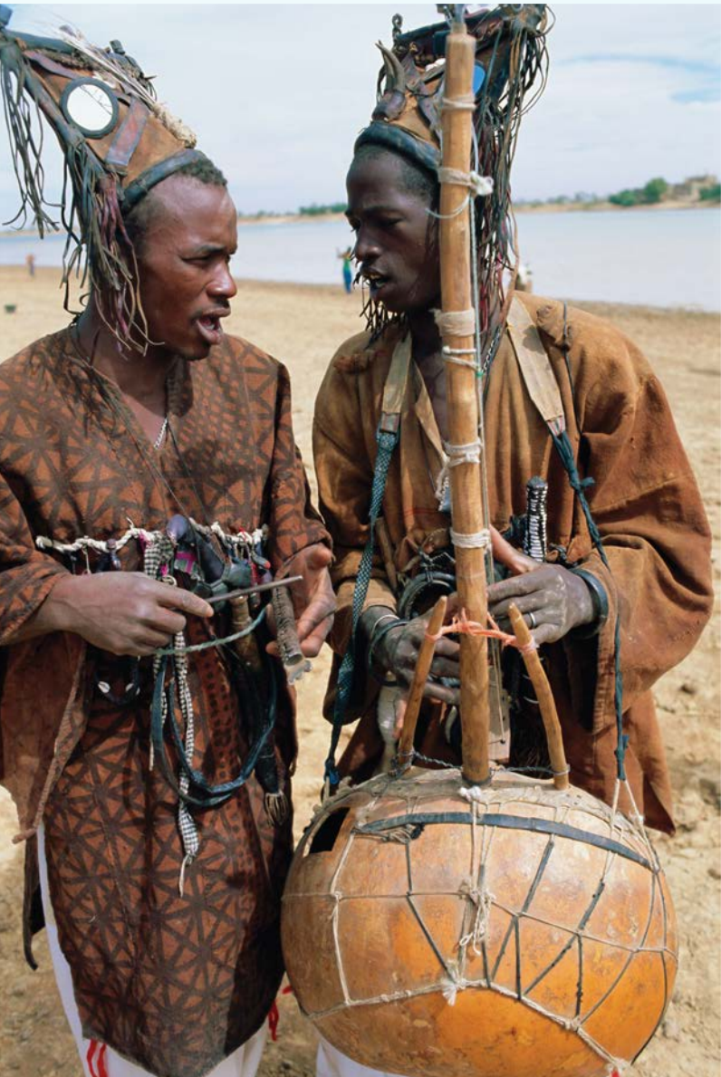
Griots performing in Mali