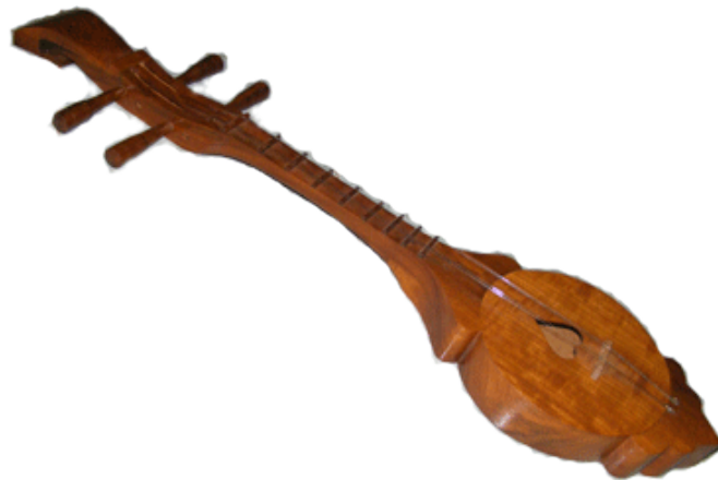
Figure 3: Se-ung 14

Percussion instruments are important to the lifestyle of the Laanna people. Historically, drums have served several roles, including indicating