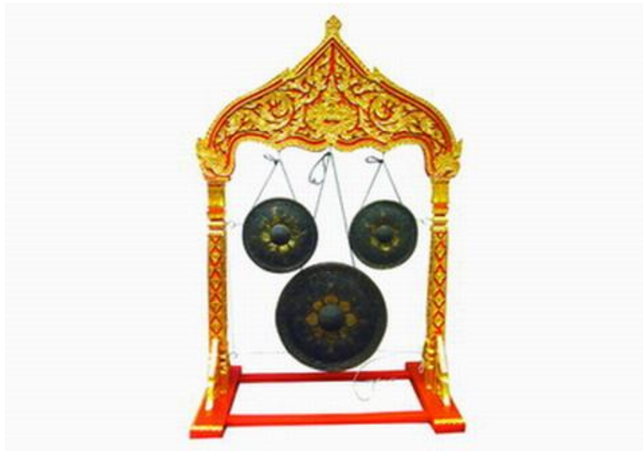
Figure 11: Mong 36