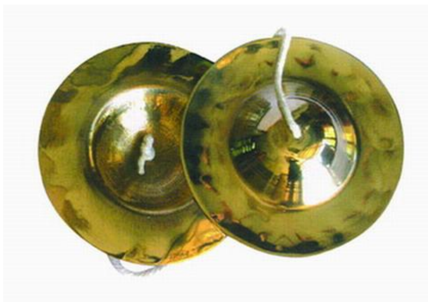
Figure 9: Chaab 34