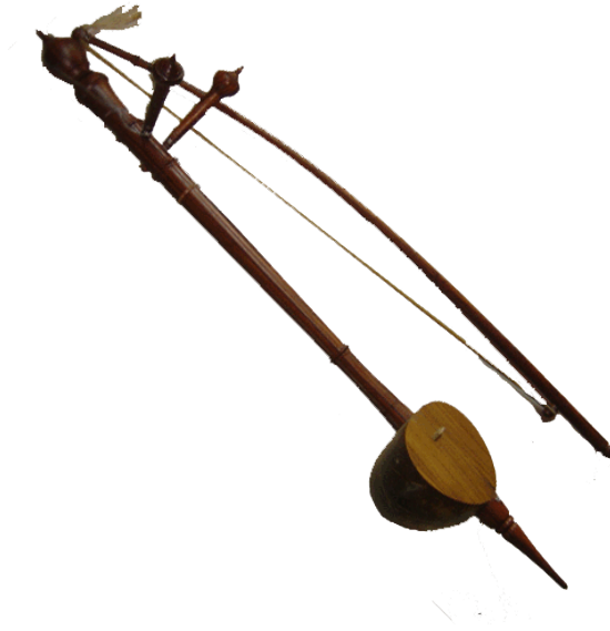
Figure 2: Sa-lor 13