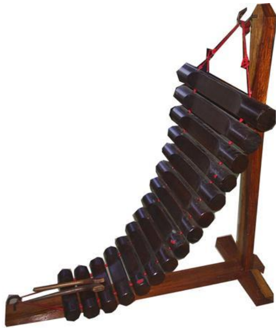
Figure 6: Ponglang 23

The central region of Thailand is an administration center and a center of culture since 557. Foreign nations visited Thailand to explore trade opportunities. While trade was initially with neighboring countries such as China, it expanded to include France, Portuguese, Holland, and the United States of America. 24