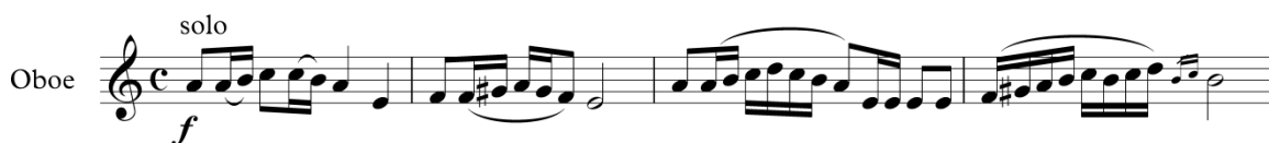
Figure 59: Thai Suite , 4 th movement, mm. 4-7, Oboe.

In measure 4, the oboe introduces the thematic melody (see figure 58). This instrument, playing the harmonic minor scale, gives a flavor of Islamic music.