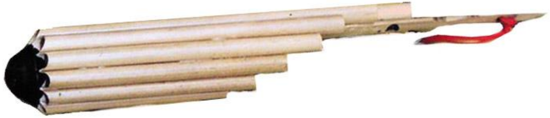
Figure 5: Wot 20

Another instrument of the Northeastern region is the Ponglang, similar to the xylophone, and found in many countries throughout Asia. Although the Ponglang is primarily a solo instrument, it is frequently found in Molam or Ponglang ensembles. Ponglang has five pitches, spanning the ubiquitous pentatonic scale (C-D-E-G-A) and was historically used to sound warnings to village populations. 21 As Ponglang has a very resonant sound, it was played in the evening to help the hunters find their way home. 22