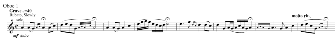
Figure 43: Thai Suite , 1 st movement, mm. 1-8, Oboe.

This movement starts with an oboe solo followed by free counterpoint between woodwinds percussion. More woodwind instruments are added and there is a modulation from A minor to B minor (see figure 44).