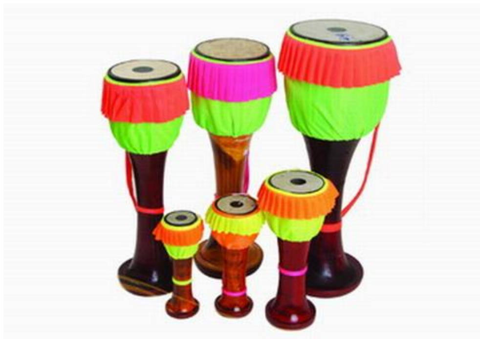
Figure 7: Glong Yao 32

(a button gong). Later, double-reed instruments were added to this ensemble. 31