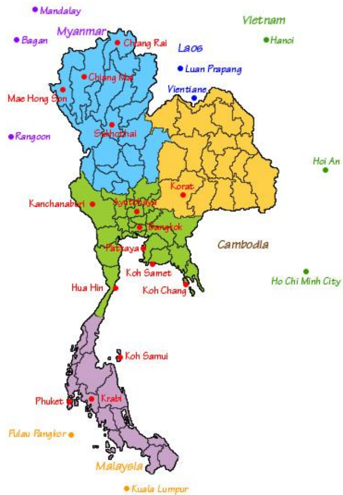
Figure 1: Map of Thailand 1