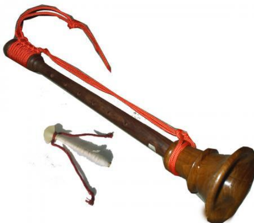
Figure 42: Laanna's double reed instrument 41

This movement starts with an oboe solo followed by free counterpoint between woodwinds percussion. More woodwind instruments are added and there is a modulation from A minor to B minor (see figure 44).