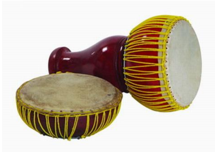
Figure 12: Thai Tabla 39