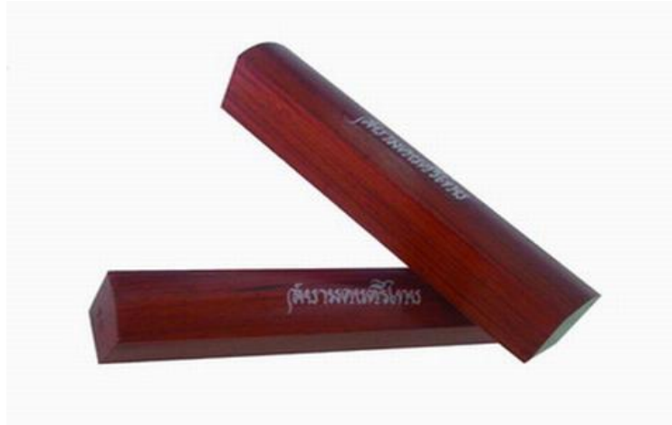
Figure 10: Grub 35