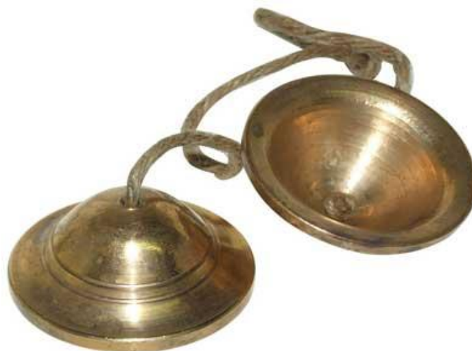
Figure 8: Ching 33