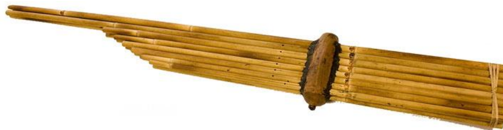
Figure 4: Khaen 18

and modern pipe organ. The Khaen has existed for over three thousand years and is found throughout Asia.