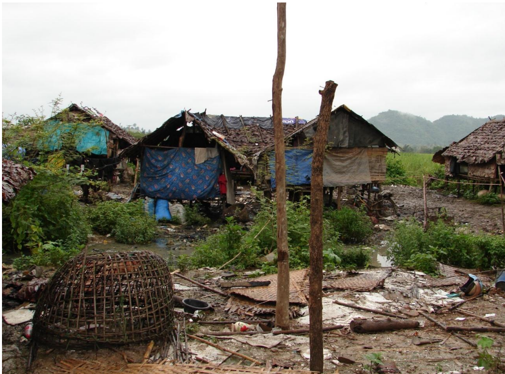
Figure 1. Mae Sot Garbage Dump in Thailand. Refugees pick through trash that can be exchanged for money. These conditions are representative of camp sections that house Burmese refugees in Thailand and Bangladesh.