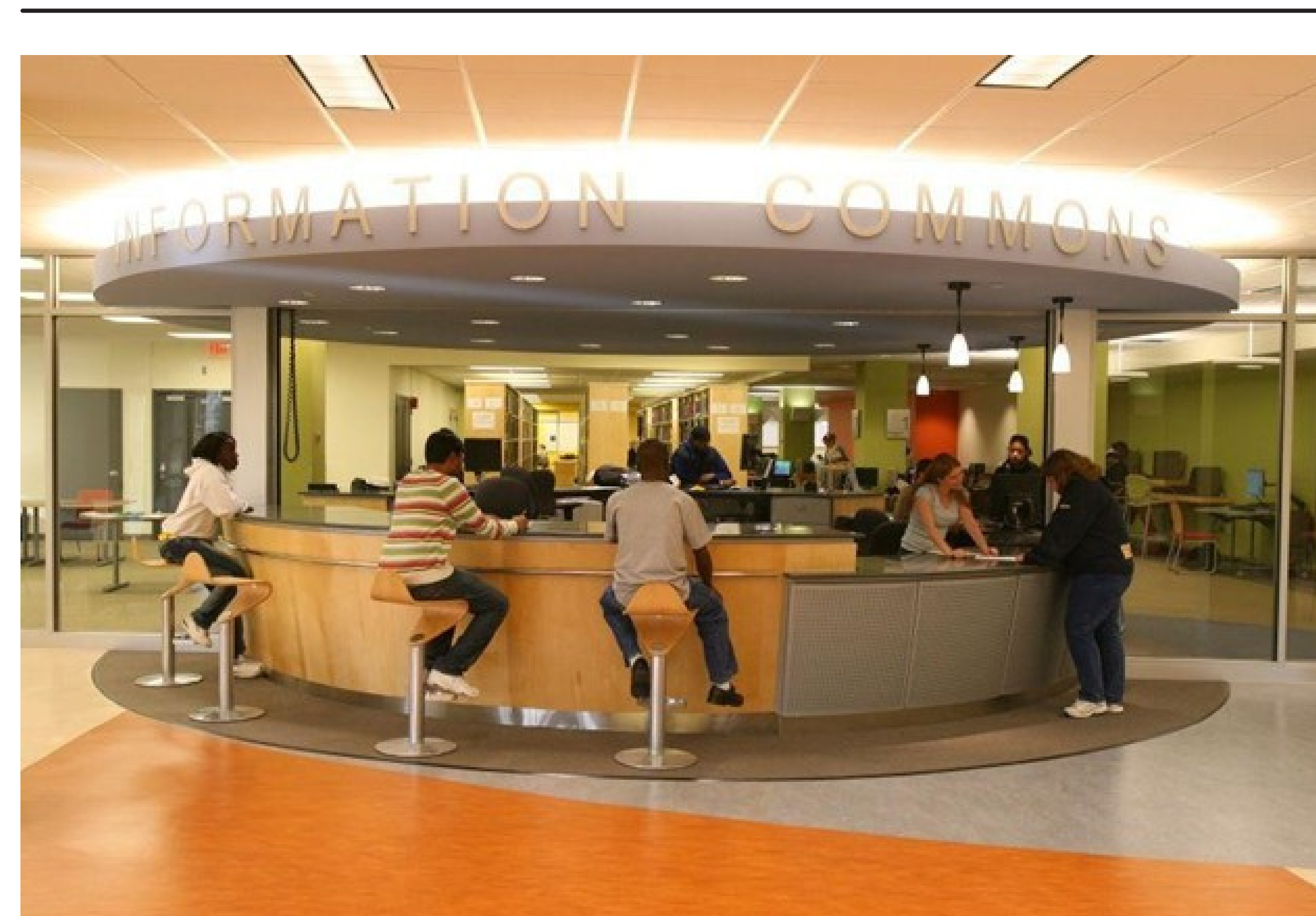
Sample image from student survey. Respondents were asked to comment on what they liked or disliked about the furniture in the image.

Internal (UL employees) and external (students, faculty, and staff) stakeholders were asked to contribute to the revisioning of the building.