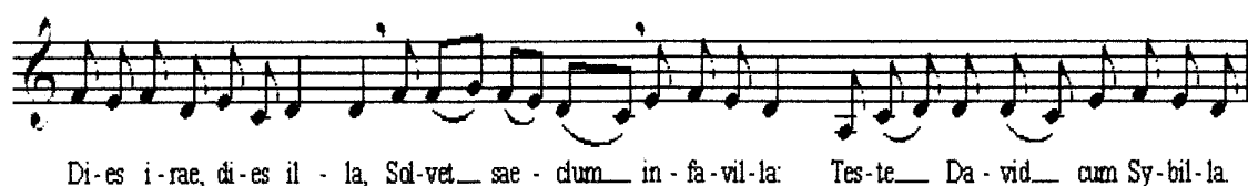
Ex. IV.32a, dies irae .

Throughout the cooking portion of the opera the Beggar uses several diversions to allow as much cooking time as possible. One of the more clever and effective sections composed by Haufrecht occurs when the Beggar tells of the stone falling into a Catholic's hands and ever since, one cannot cook meat with the stone on a Friday or the meat will turn black. 55 Here, the topic is clearly a sacred church setting and the bassoon and bass clarinet play the dies irae : the Gregorian chant used in the mass for the dead (see Example IV.32 and Example IV.32a). 56 The addition of the dies irae creates an exaggerated religious fervor used by the trickster to emphasize the stone's powers.