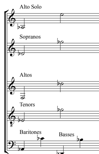
Table 5. The Drowned Lovers Range

Again, Bingham employs the vocal effects of humming and trilling to keep pitches accurate and aid in finding the next pitches. As in Water Lilies , the sopranos are