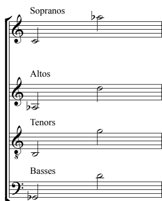
Table 6. Missa Brevis "The Road to Emmaeus" Range

The range is comfortable, less expansive than some of Bingham's other works (table 6).